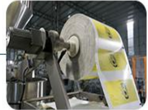
Packing Film Holder