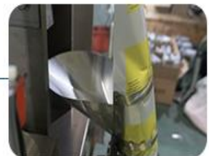
Bag Sealing Device