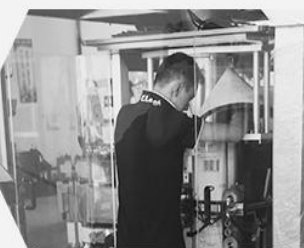
DEBUGGING AND TESTING THE FINISHED PRODUCTS